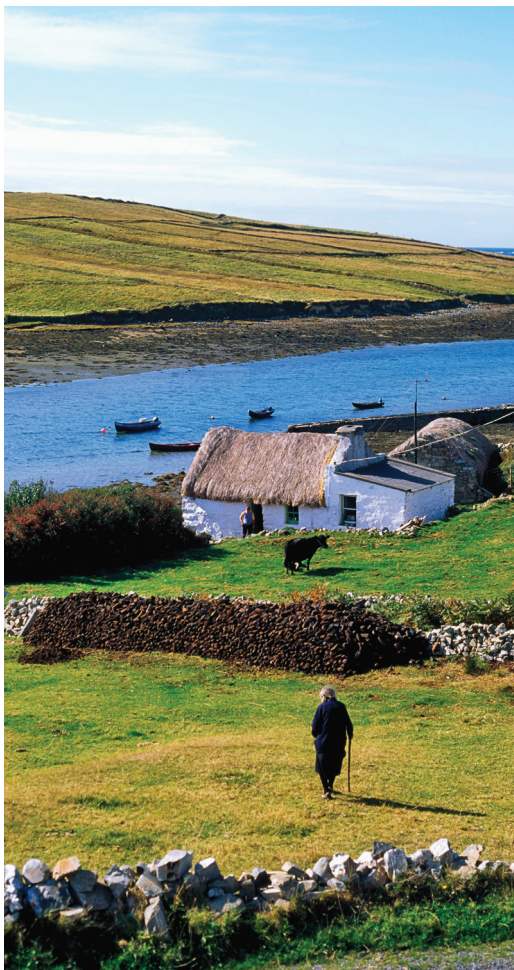
We spend Day 6 on the Aran Islands’ Inishmore.