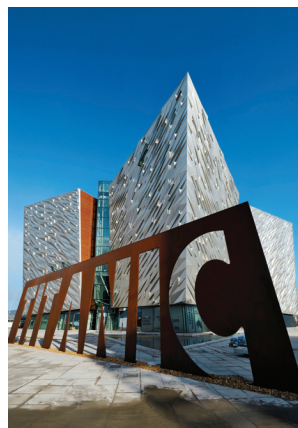
Titanic Museum, optional extension

tour of Kilkenny itself, noting the many buildings of “black” or Kilkenny marble, quarried locally. After lunch together at a local pub, the remainder of the day is at leisure. B,L